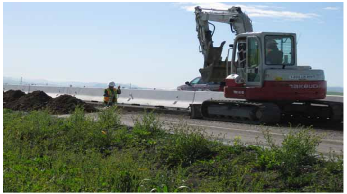
Paving digging Stage 2 traveled way