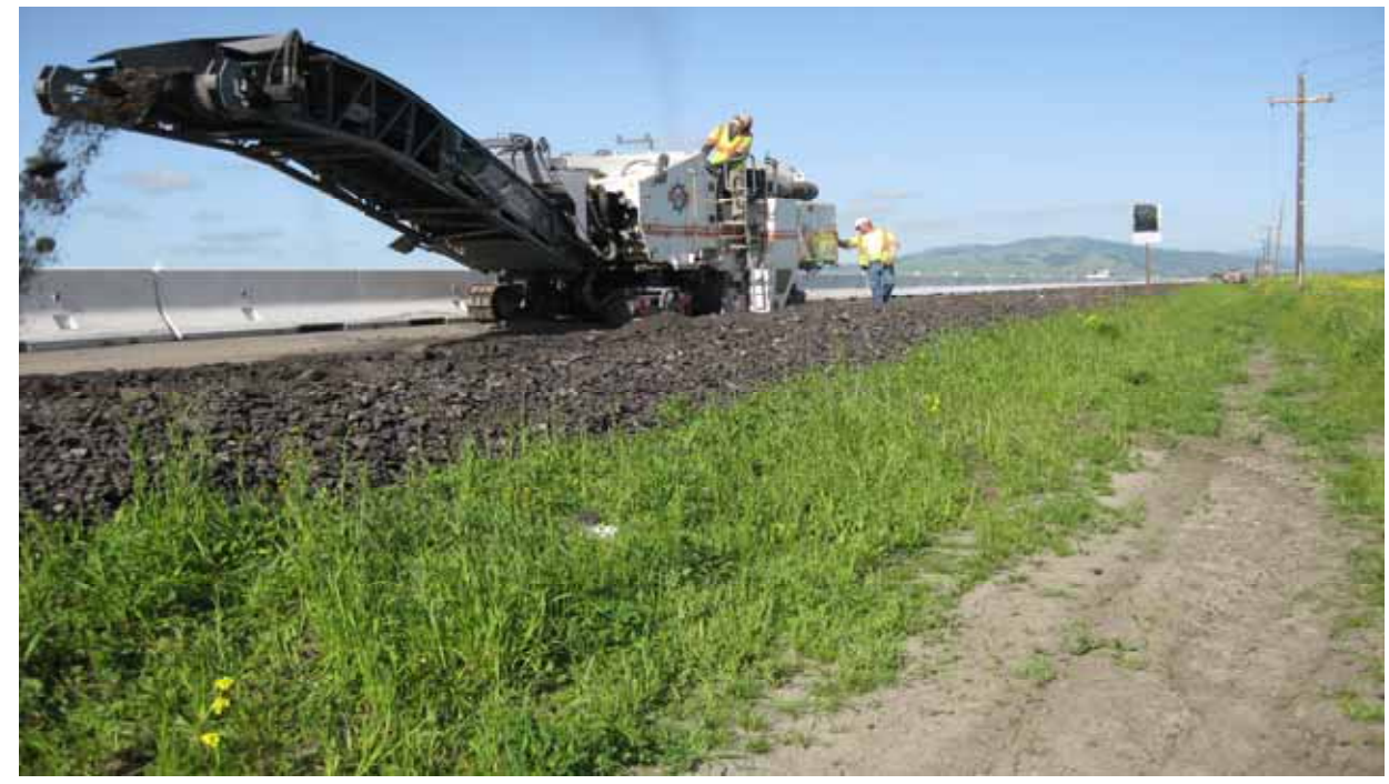
Grinding @ Shore Rd