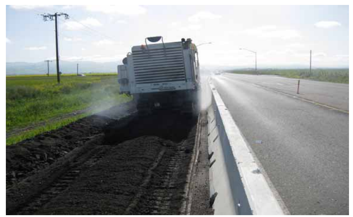
Grinding the widening at Shore Rd.